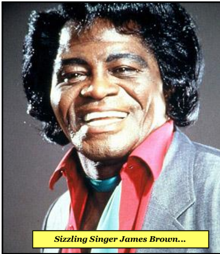
Sizzling Singer James Brown...

T he DEAD CANNOT REACH YOU FROM THE GRAVE! Their FATE is SEALED because "...it is APPOINTED unto men ONCE TO DIE, but AFTER THIS the JUDGMENT " (HEBREWS 9:27). But they SO MUCH want to talk to you , to WARN YOU!!!