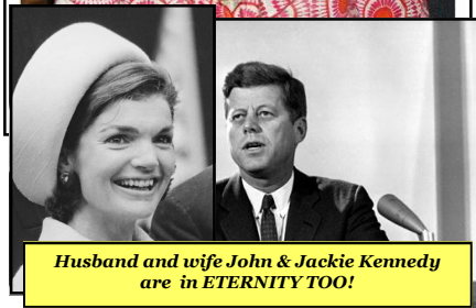
Husband and wife John & Jackie Kennedy are in ETERNITY TOO!

AFTERWARD , when the rich man realized there was NO HOPE , he wanted to SEND WORD to his father's house where his five brothers lived , "... LEST THEY ALSO COME INTO THIS PLACE OF TORMENT... " (LUKE 16:28). But, the ONLY WARNING loved ones will receive, will NOT COME from the " dearly