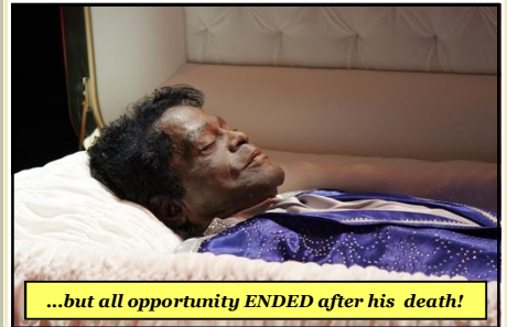
...but all opportunity ENDED after his death!

If all the souls IN HELL could come out and WARN THE WORLD , they WOULD , but God has MADE THIS IMPOSSIBLE , so that MAN will