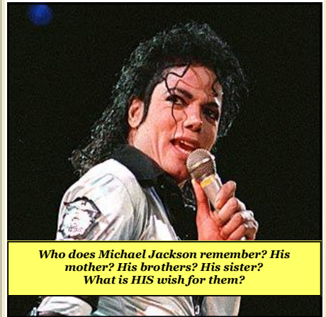
Who does Michael Jackson remember? His mother? His brothers? His sister? What is HIS wish for them?

Satan would like THE LIVING to believe that their " departed loved-ones " are " Resting In Peace (R.I.P.) ," but for MOST , that is FAR FROM the truth! The VAST MAJORITY of the dead have REFUSED to repent! Yet, Jesus is still saying , "... except YE REPENT, ye shall ALL LIKEWISE perish! "