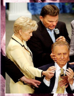
Televangelists Clark and Kenneth Copeland lay hands on Oral Roberts.

But, in this world, these hypocrites "...HAVE THEIR REWARD" (MATT. 6:2, 5, 16), because "WOE UNTO YOU, when ALL MEN shall speak WELL OF YOU! For so did their fathers to the FALSE PROPHETS" (LUKE 6:26).