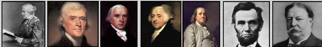
Susan B. Anthony DEAD