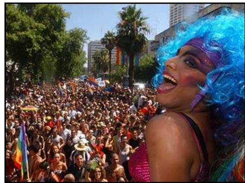
GAY PARADE IN THE STREETS OF JERUSALEM

Since God brought them back into their own land in 1948, and also delivered them several times from Islamic armies and terrorist who are determined to destroy them, Israel continues to rebel against God, committing abominations like allowing Sodomites to parade through the streets of the Holy City Jerusalem , where God said "... Jerusalem, which I have chosen out of all tribes of Israel, will I put my name FOREVER " (2 Kings 21:7).