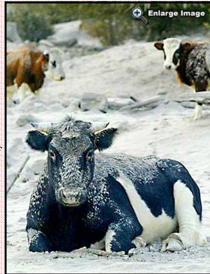
Deep ash from Chile's Chaitén volcano has blanketed grazing land eastward into Argentina, threatening to cause millions of livestock to die of starvation.

Other hazards caused by Chaitén's eruption threaten residents of the region who are unable to evacuate or fend for themselves against the volcano's fury. Officials fear that two million sheep in the Argentine province of Chubut are in danger of starvation because the ash has covered and killed the vegetation the animals depend upon for food.