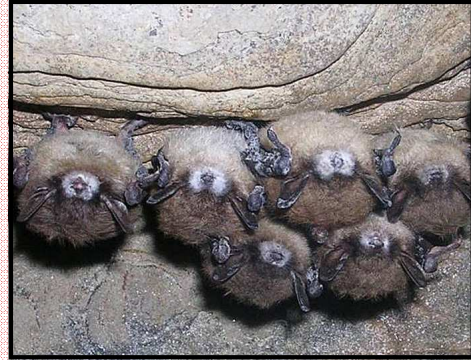
The white fungus found around affected bats noses appears to be a sign of poor health and not the cause of the deaths.

The U.S. Geological Survey's (USGS) National Wildlife Health Center in Wisconsin has examined nearly 100 bat carcasses from the affected region . Researchers there say they have been unable to determine exactly why the bats died of " white-nose syndrome " — a term used because of an overgrowth of a fungus normally present in the flying mammals but found covering large areas of the dead bats, including around their noses. The excessive fungus is believed to be merely a sign of overall poor health rather than a primary cause of the deaths.