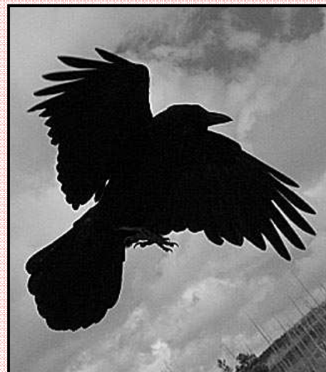
More than one "unkindness" of ravens has attacked farm animals across Britain, partially eating them alive.

Ravens traditionally eat dead livestock, but they are also known to prey on small mammals, including dormice, voles and rabbits. It is believed that since European regulations mandate that carcasses be disposed in disposal facilities, the scavengers now feed on the living.